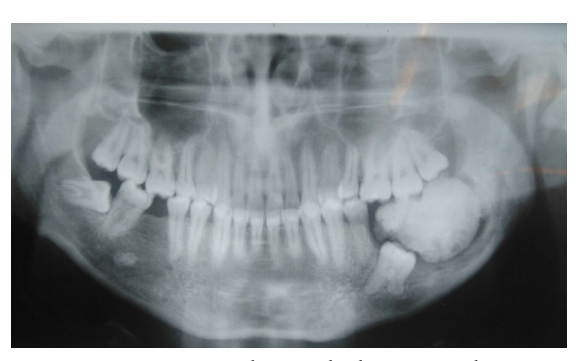
Fig. 2 – Panoramic radiograph showing radiopaque mass with radiolucent rim

The panoramic radiograph showed a 3.6 cm x 3 cm compact radiopaque mass surrounded by a thin radiolucent area. The first left lower molar was retained underneath the mineralized mass. Upper molars were in contact with the mass (Fig. 2)