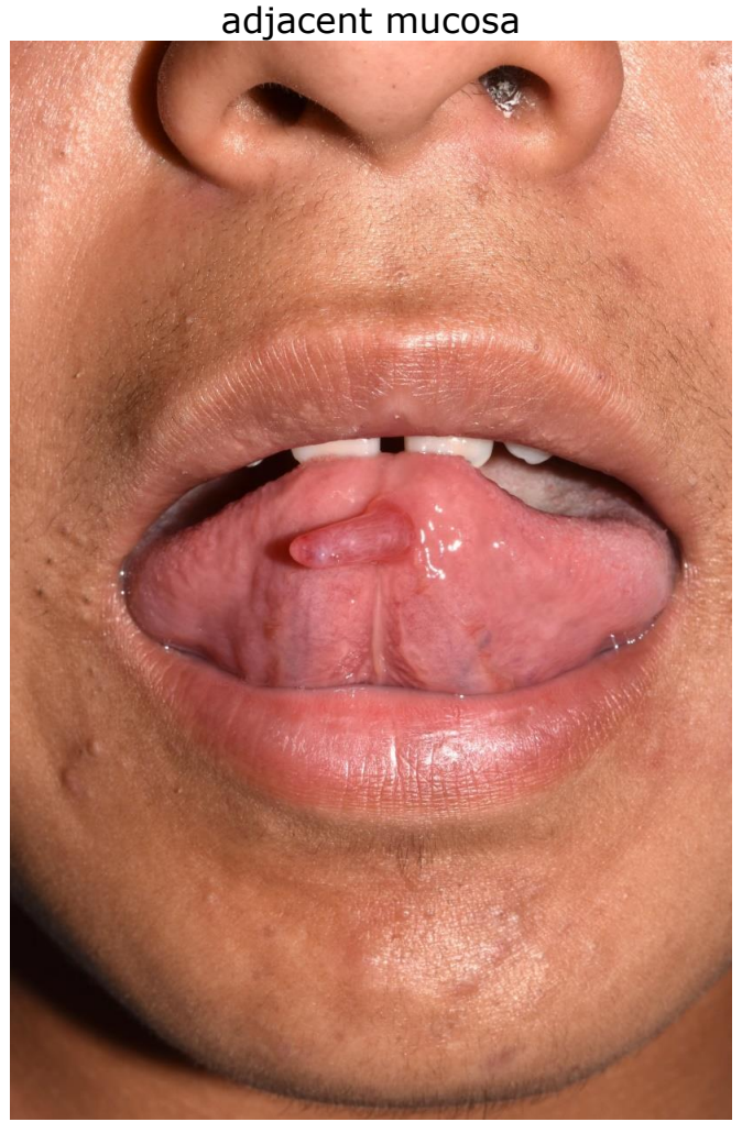
Fig. 1: Localized cylindrical increase in volume on the ventral surface of the tongue to medial on the left side, slightly more erythematous than the

In the direct interview, the patient did not report any relevant inherited family, non-pathological and pathological personal history or any history of tongue trauma.