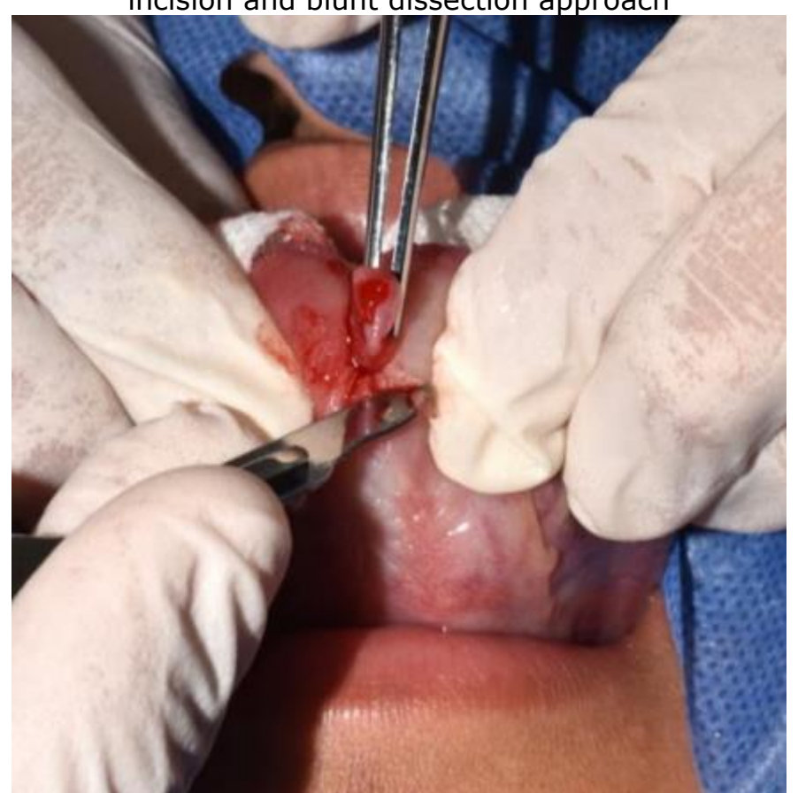
Fig. 3: Surgical excision following the established protocol, surgical spindle incision and blunt dissection approach

In the macroscopic description, a single soft tissue specimen was received from the ventral surface of the tongue, fixed with 10% formalin, measuring 0.9 \text{ cm} \times 0.4 \text{ cm} \times 0.3 \text{ cm} , oval in shape, irregular surface, light brown with gray areas and firm consistency. The whole specimen was placed in the ENES 58-18 capsule for processing (Fig. 4).