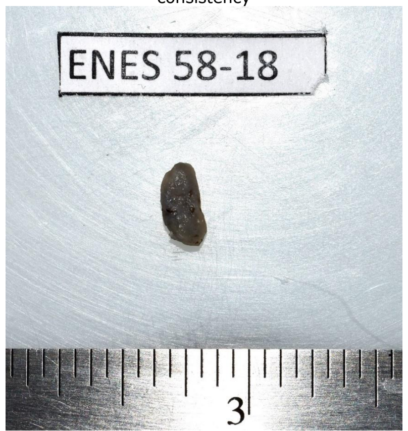
Fig. 4: A single soft tissue specimen was received from the ventral surface of the tongue fixed with 10% formalin, measuring 0.9 cm x 0.4 cm x 0.3 cm, oval in shape, irregular surface, light brown with gray areas and firm consistency

The microscopic evaluation reported the following: cavity composed of amphophilic material compatible with mucin, scarce foamy macrophages, bacteria, chronic, moderate and diffuse inflammatory infiltrate and erythrocyte extravasation. The specimen is surrounded by a pseudocapsule of dense fibrous connective tissue with profuse vascularization with vessels in hemocongestion. Towards the surface, parakeratinized stratified squamous epithelium with acanthosis was observed (Fig. 5) so the diagnosis was mucosal extravasation.