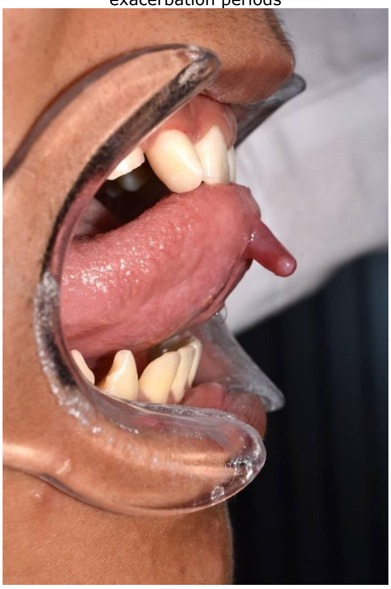
Fig. 2: Side view of cylindrical volume increase on ventral surface of the tongue, smooth surface, soft consistency, asymptomatic, with remission and exacerbation periods

The relevant informed consent was signed and the outpatient excisional biopsy was scheduled. The surgical protocol included disinfecting the surgical area with iodine povidone, sterile antisepsis, local infiltration with 1:100,000 articaine, full-thickness surgical spindle incision, hemostasis, surgical site treatment, and isolated stitches with 4-0 polyglycolic acid (Fig. 3). The specimen was then transferred for histopathological study.