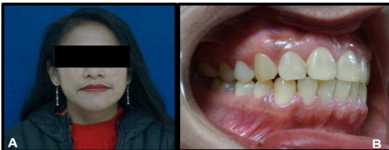
Figure 1A: The extraoral view shows a slight facial asymmetry with increased volume of the right lower and posterior hemiface a slight decrease in loss of the right nasolabial line. B. Intraoral view. Mild expansion of vestibular outer cortex, no change of mucosal color, prominent superficial blood vessels.

slight increase in the volume of the vestibular mucosa of the lower right molar region without color alterations. We detected prominent superficial blood vessels, a slight expansion of the external cortex, crepitus, moderate pain on palpation, absence of tooth 4.8, increased sensitivity of tooth 4.7 to thermal tests, and a tingling sensation on vertical percussion. There was evidence of increased crepitus and pain radiating in a caudal direction on deep palpation of the right mandibular ramus on its inner side. (Fig. 1B).