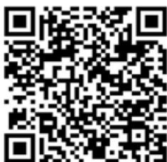
Figure 1: QR code: Databases consulted

The researchers simultaneously analyzed and preselected the studies after reading their titles and abstracts. Then, each article was read in full. The eligibility criteria for the analysis, selection, and exclusion process were as follows: