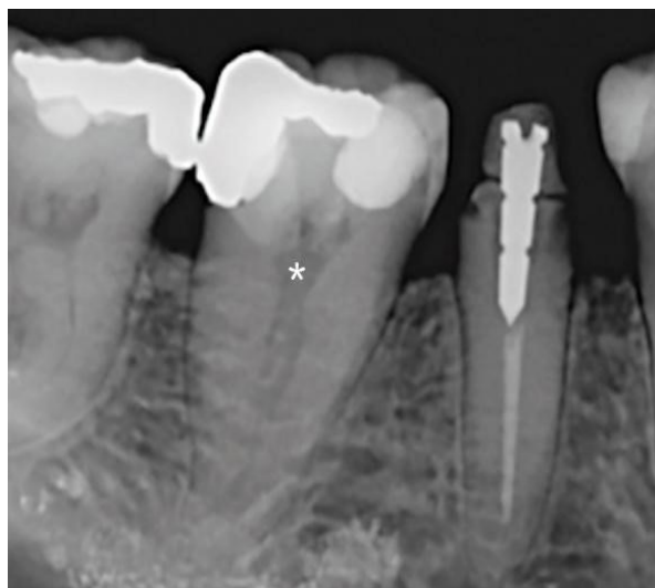
Figure 1: Periapical radiograph. Note the diffuse image of a canal centered along a single root in the mandibular first molar(*): an extremely rare finding.

Following the legal health standards, the costs and advantages of CBCT compared to the imaging studies already performed were discussed with the patient. She was told that informed consent was required after considering the risks and benefits of CBCT. The patient was also notified of the potential therapeutic errors of endodontics if the practitioner did not have the information provided with a more reliable study. Once all the information was provided and discussed, the patient agreed to undergo the study in the imaging